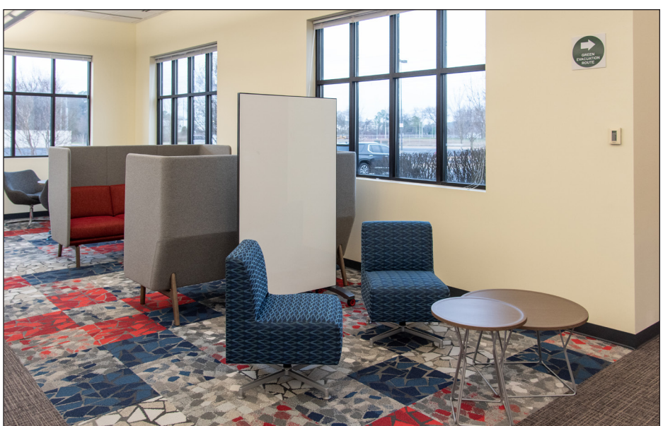
New office upgrades and collaborative areas at the U.S. Army Engineering and Support Center, Huntsville

As of August 2022, the Furnishings Program manages on average 230 active projects, and of those projects 96 percent were completed on time and within budget. Feedback received from centrally funded customers continues to be positive and include: consistency of furnishings purchased, higher quality of product which equals a long life cycle duration and cost avoidance. With the reduction in government spend plans, longer life cycle duration and cost avoidance are key factors to ensure facilities can continue to be occupied. Historically, the program receives upwards of 15% in annual cost savings due to the volume of orders executed through the Furnishings Program. These savings are redirected to unfunded requirements provided by customers.