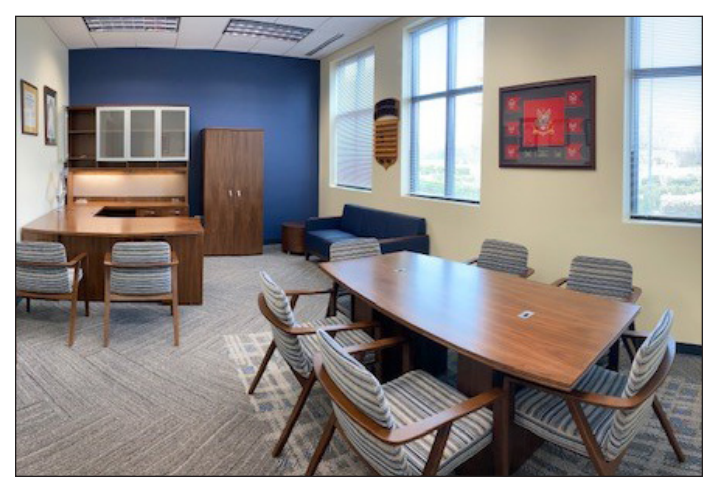
Office upgrades at the U.S. Army Engineering and Support Center in Huntsville, Alabama.

Huntsville Center is also designated as the central manager of furnishings procurement for the Installation Management Command to oversee a cradle-to-grave concept and ensure that standardized furnishings are provided for all requirements. The Furnishings Program's primary mission is to buy furnishings in accordance with customer requirements and to manage the delivery of those items to the new or renovated facility by the beneficial occupancy date.